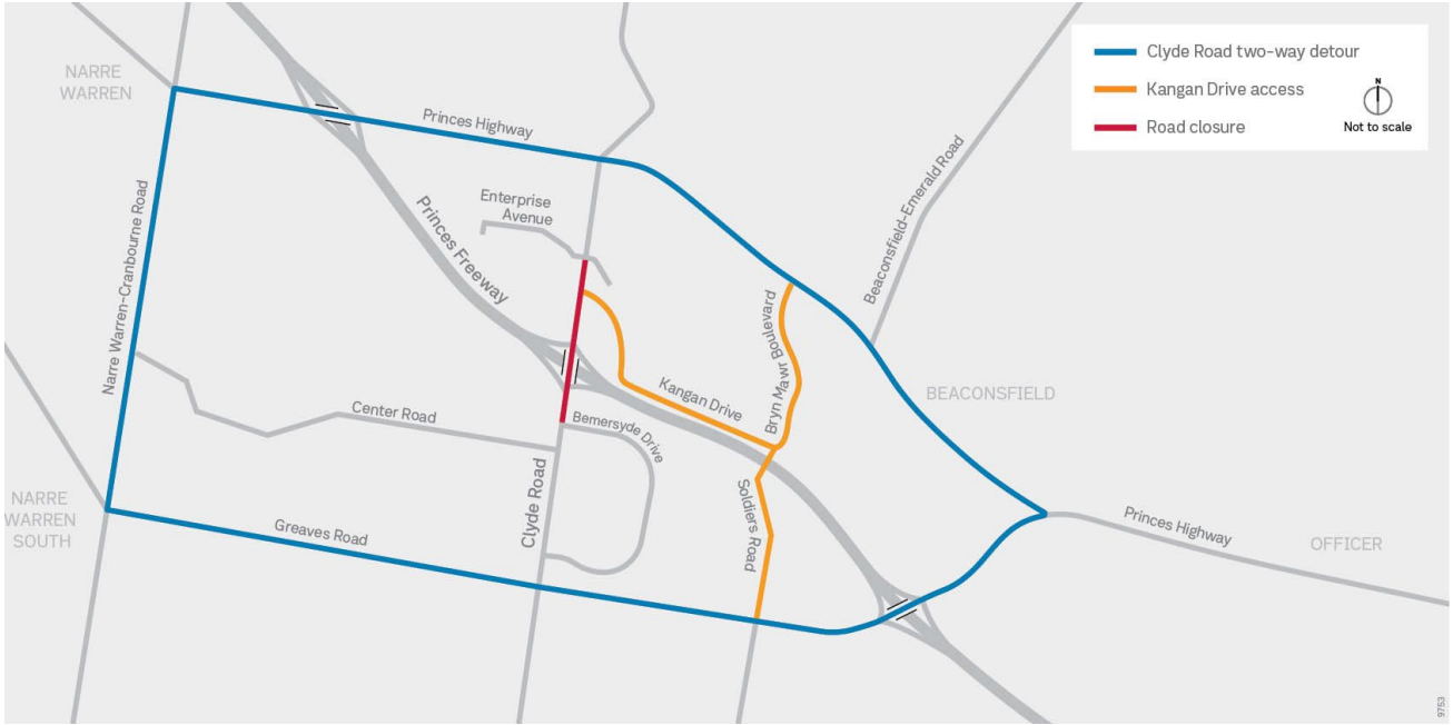
Map 2: In place from 8pm, Friday 16 January to 5am, Monday 19 January, between 8pm and 5am each night: