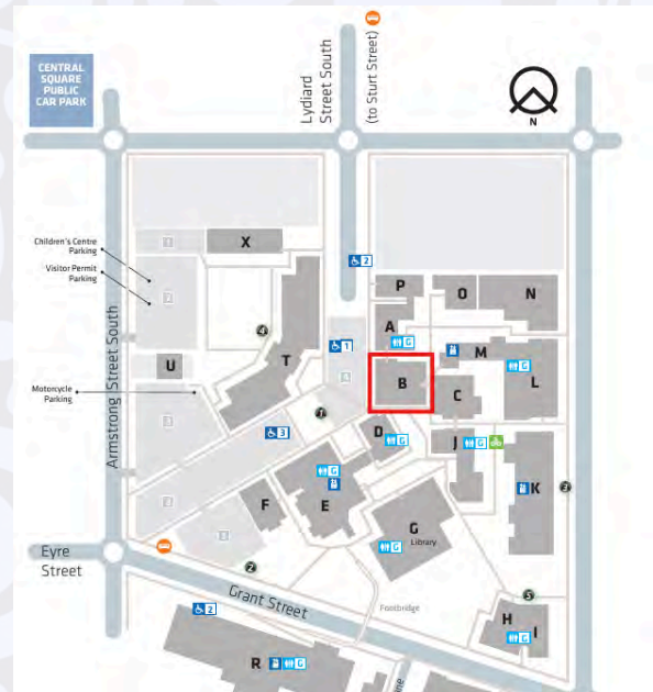
SMB campus map

Our team will be working closely with Kinaway approved Indigenous organisation Winya, to incorporate Indigenous designed furnishings, artwork and decor that reflect culture.