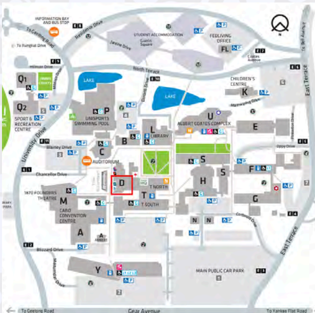
Mt Helen campus map

The centre is undergoing an exciting transformation, with ongoing refurbishments at both the SMB and Mt Helen campuses. These upgrades are part of a broader initiative to establish a safe and inclusive environment for Indigenous students to connect, relax, and thrive.